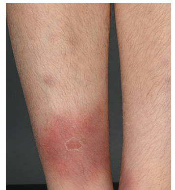
9 Erythema nodosum