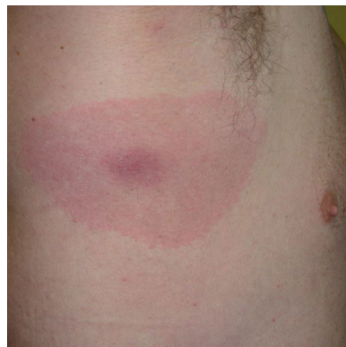
8 Erythema migrans