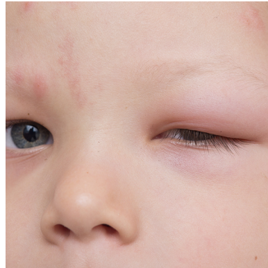
2 Insect bite