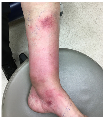
7 Sweet's neutrophilic dermatosis