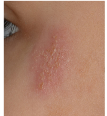
3 Cutaneous herpes