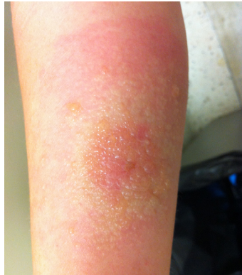
1 Contact dermatitis