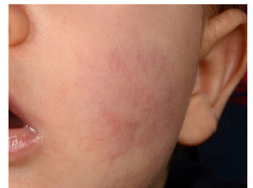
6 Cold panniculitis